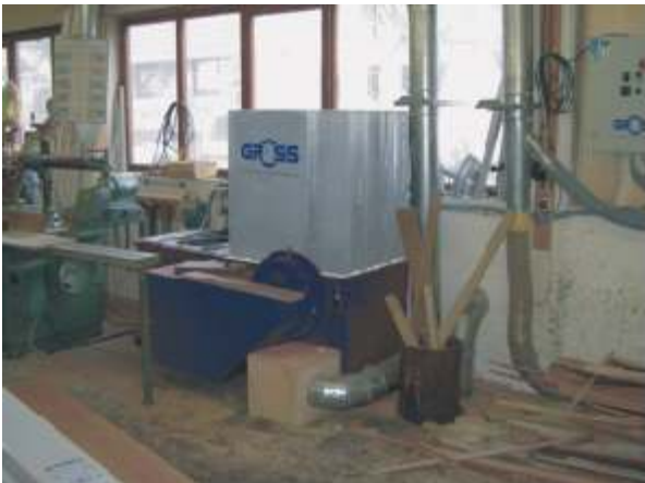
GAZ 62 used at a joiner's woodshop