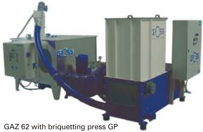
GAZ 62 with briquetting press GP

The GAZ 62 series shredders are compact and designed for high performance.