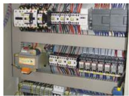
Switching cabinet / SPS control