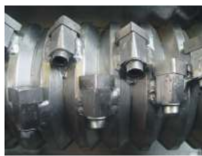
Profile rotor with welded knife carriers (GAZ 62 S)