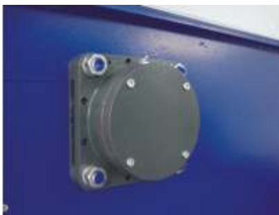
Rotor housing guarantees the smooth running of the shredder.