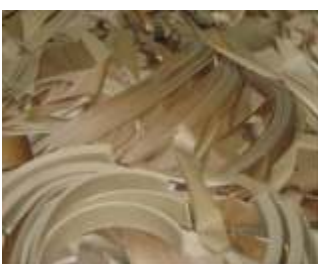
Waste from furniture manufacturing