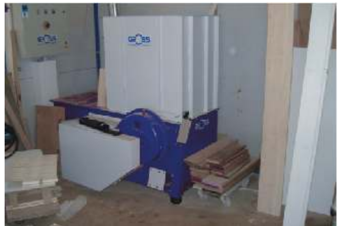
WL 4 in a joinery