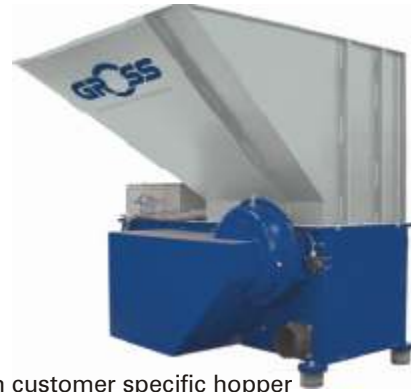
GAZ 62 with customer specific hopper