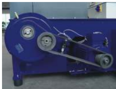
Transmission and motor