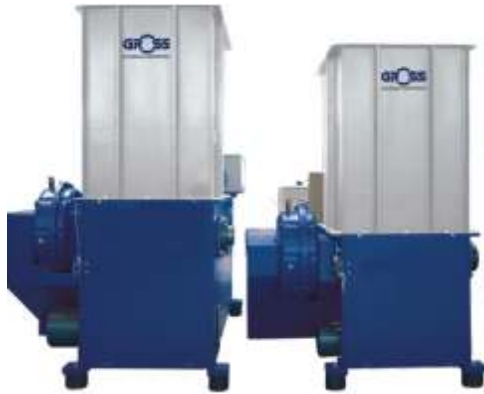
GAZ 62 S (großer Rotordurchmesser mit 368 mm) GAZ 62 (kleiner Rotordurchmesser mit 252 mm)