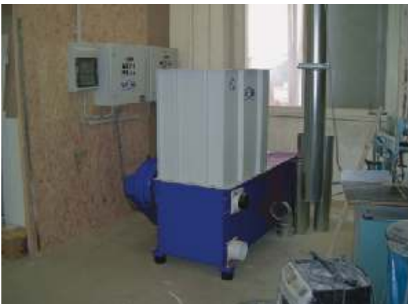
GAZ 62 shredder connected to an air suction system