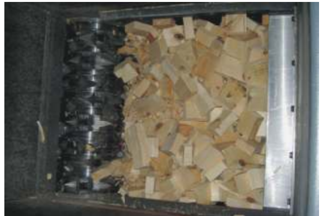
Hopper, filled with material