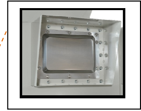
ATEX certified anti-explosion vent