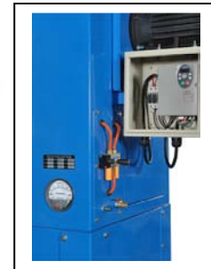
Control level device