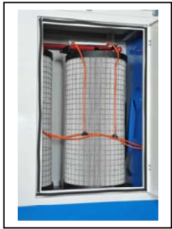
Pneumatic Cartridge Filter