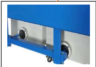
Vacuum bag suction device